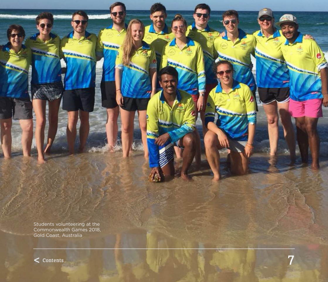
Students volunteering at the Commonwealth Games 2018, Gold Coast, Australia